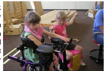
The children enjoying to play with stretching frogs as they work on warming up their hands for the program ahead in last