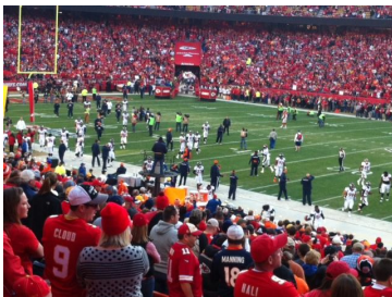
Broncos warming up for game @ Chiefs Arrowhead stadium