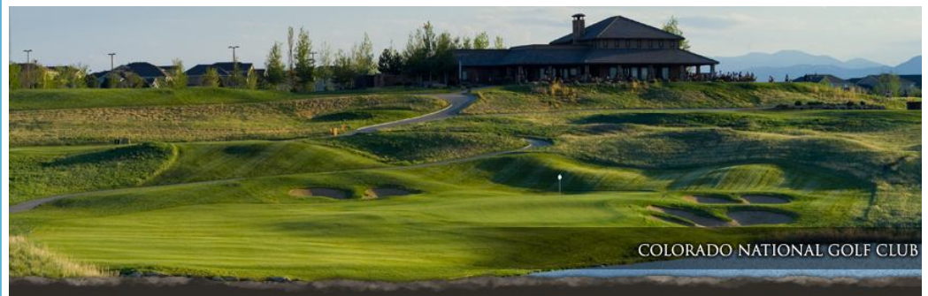
COLORADO NATIONAL GOLF CLUB

The Colorado Foundation for Conductive Education is a 501(c)(3) public charity committed to providing opportunities for individuals with motor challenges to achieve optimal physical, cognitive and social independence through the application and promotion of Conductive Education principles.